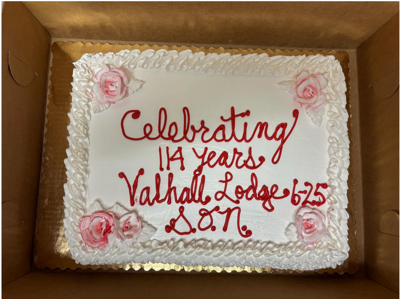
Valhall Lodge was founded in 1912.