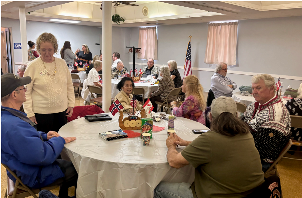
These photos were taken at the Social on February 8, 2025.

More details will be publicized as they become available.