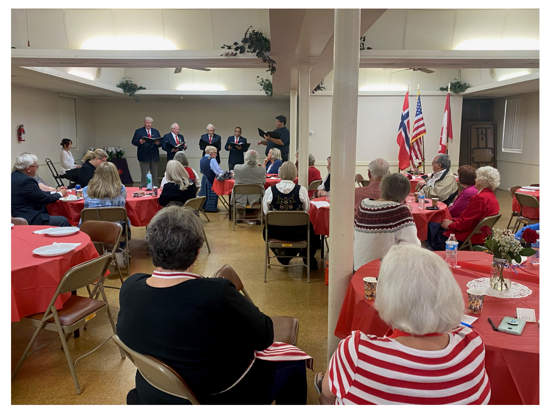
The Mannskor sang at the Lodge's Syttende Mai social.