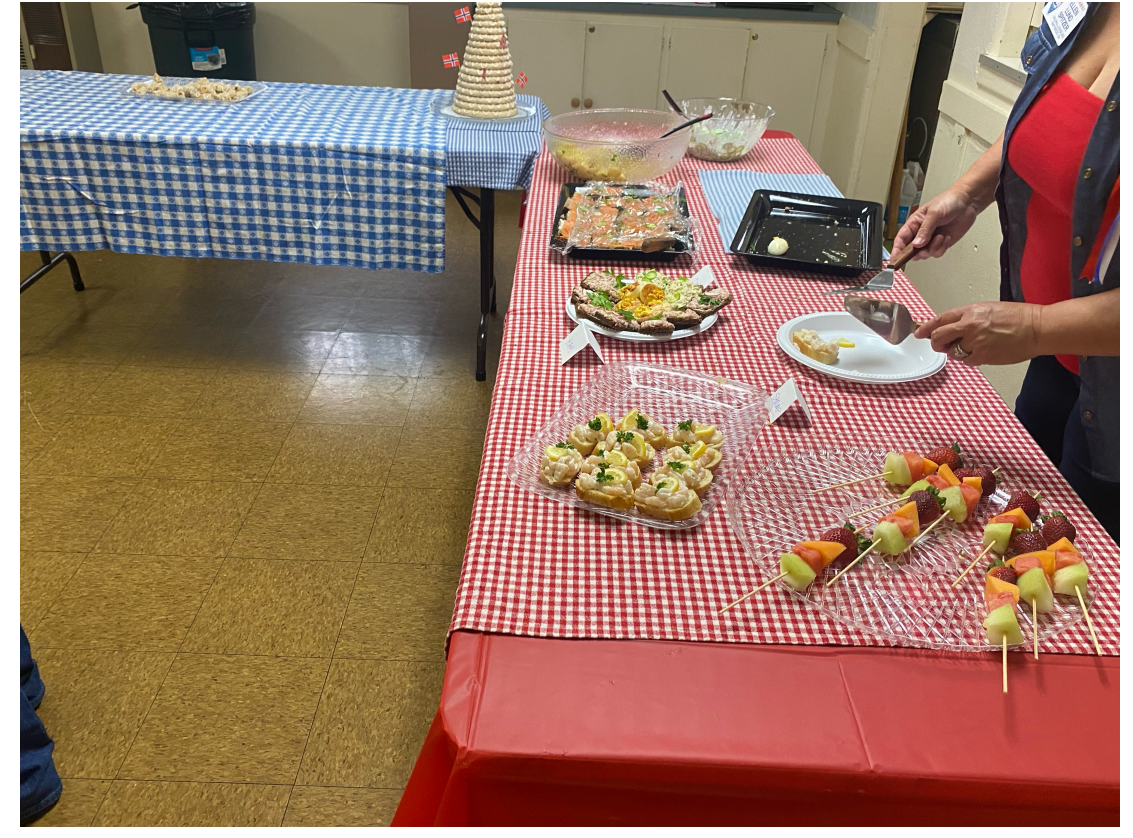
The Lodge Syttende Mai social featured open-face sandwiches.