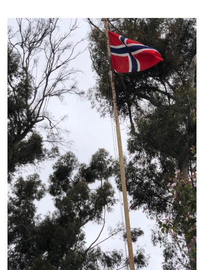
VALHALL VIKING 14

Right: The Norwegian Flag flies at Balboa Park.