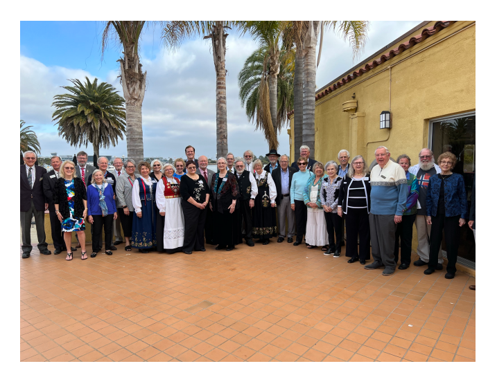
The Fish Club had a wonderful turnout for their Syttende Mai dinner, which took place on May 17.

Celebration of Syttende Mai took place on the morning of May 17 at Balboa Park. Thanks to the House of Norway for arranging this.