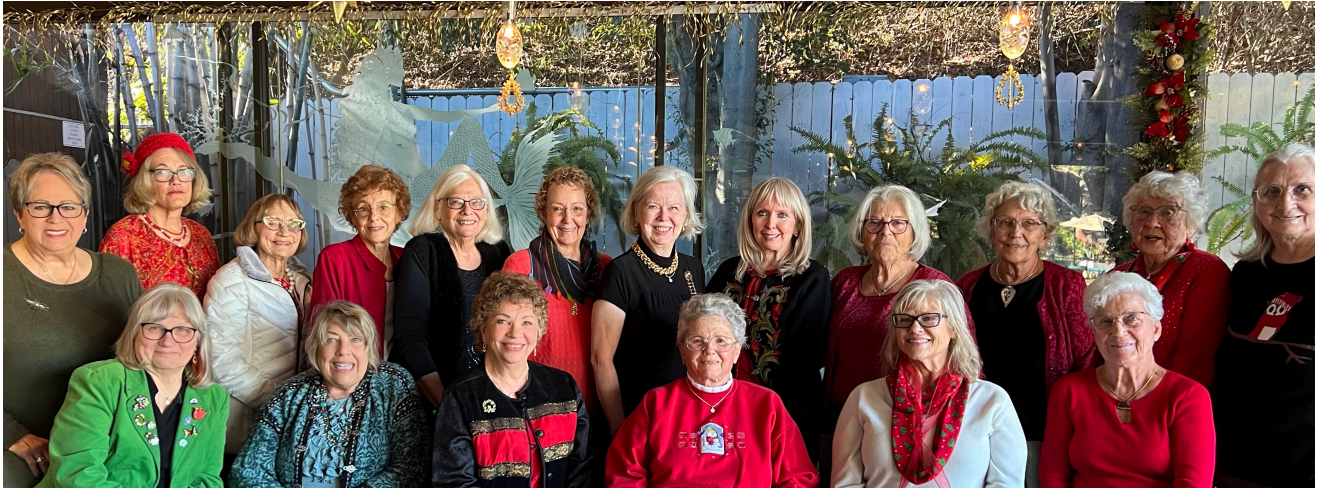
Ladies of Valhall have a fabulous Christmas luncheon.