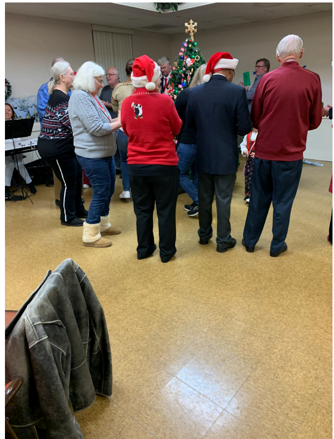
Dancing around the Christmas Tree