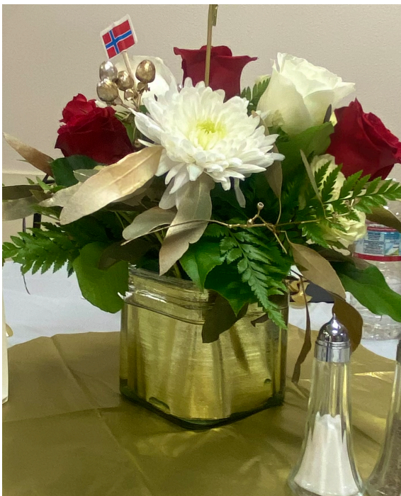
Each table had a floral arrangement like the one above.