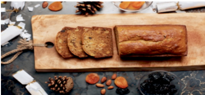
Almond spice bread – small loaf in ceramic pan