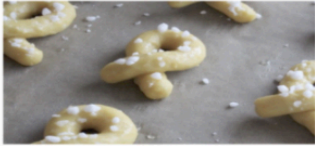
Berlinerkranser – pkg of 6 Price: $4 8 dozen available

Images are only examples. Delivered items may look different.