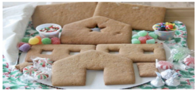
Gingerbread house kit – pieces for one house