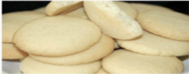
Powdered sugar butter cookies – pkg of 6 Price: $4 4 dozen available