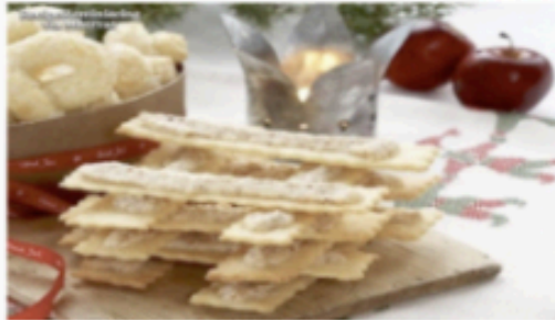
Bordstabel – pkg of 6 Price: $4 4 dozen available