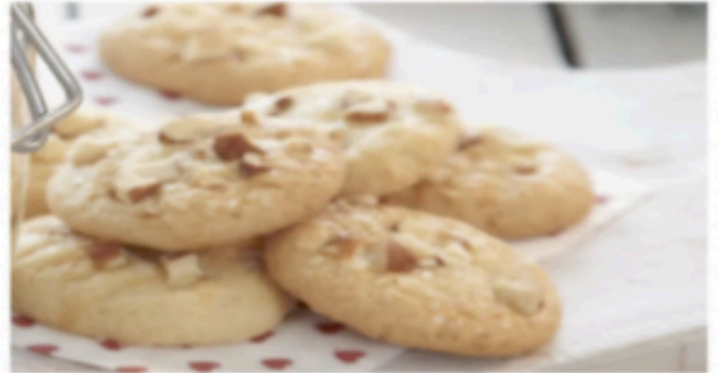
Serinakaker – pkg of 6 Price: $4 4 dozen available