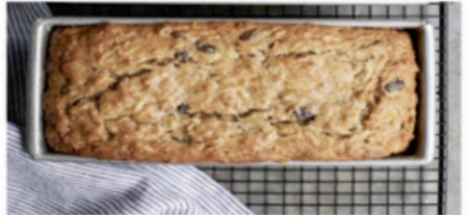
Apple bread – small loaf in ceramic pan Price: $4 5 loaves available