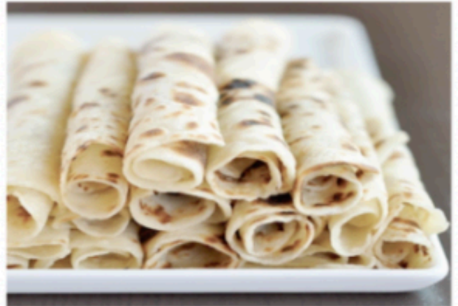
Lefse – pkg of 6 Price: $8