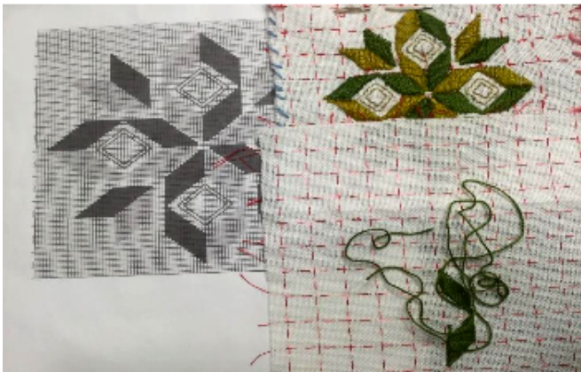
Hardanger Project 1: Starting Over