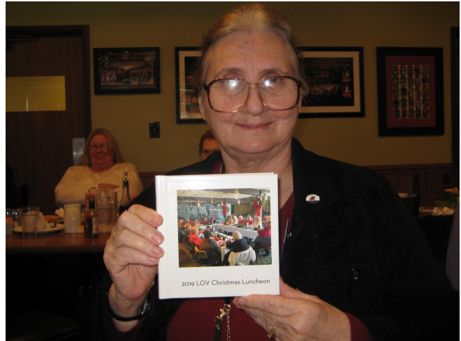
Linda created a picture book commemorating the 2019 LOV Christmas Party.