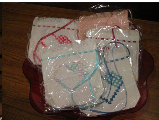
Door prizes at LOV