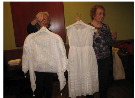
Dresses Thelma made for granddaughter