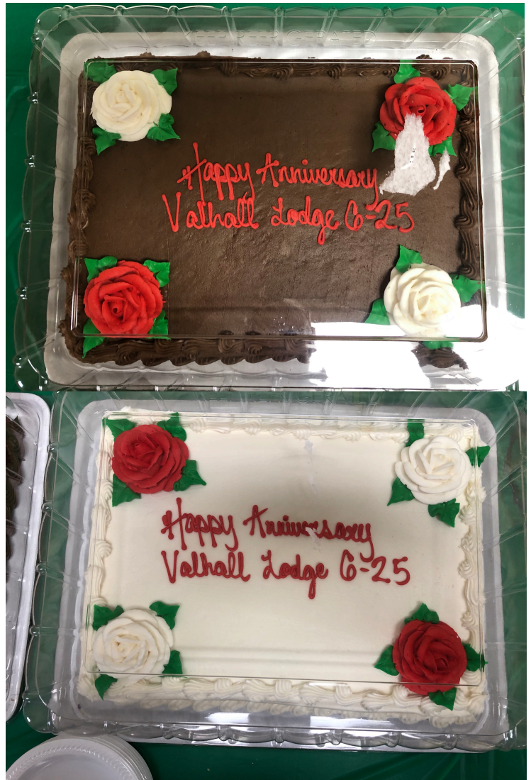
We had both chocolate cake and white cake to commemorate our anniversary.