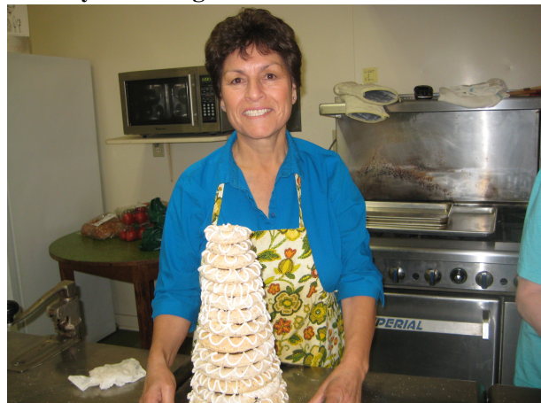
Our First Lady attended the cooking class.