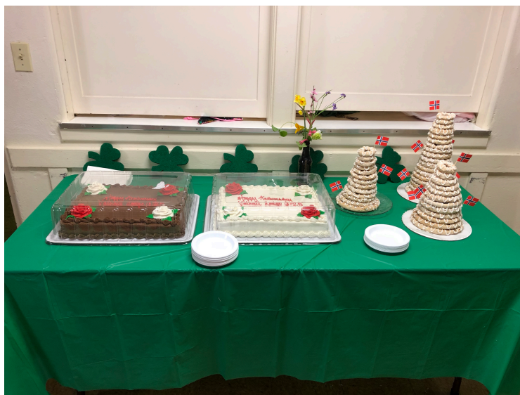
Dessert included wonderful cake and kransekake.