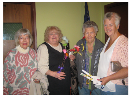
Visitors from Swedish Club