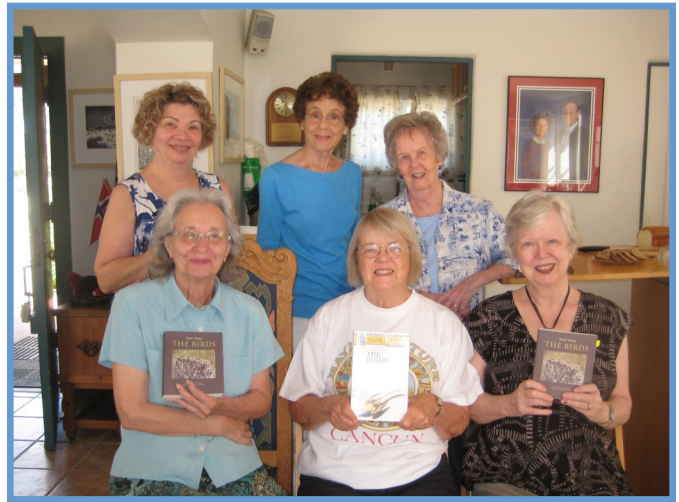
LOV to Read met on August 4 to discuss The Birds by Terjei Vesaas.