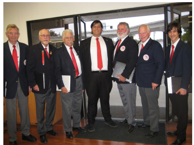
The Mannskor entertained at the May Social