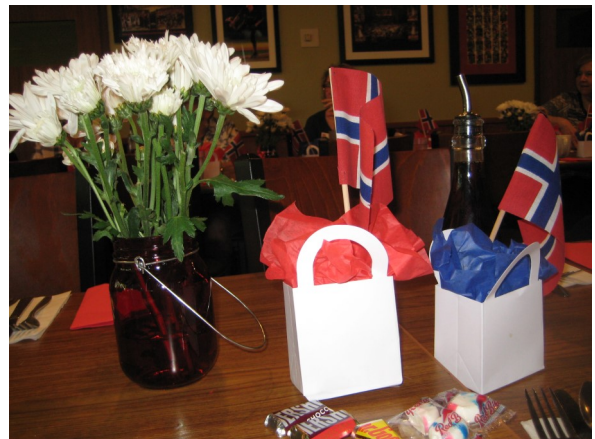
The May decorations/door prizes at the LOV meeting had a Sytende Mai theme.